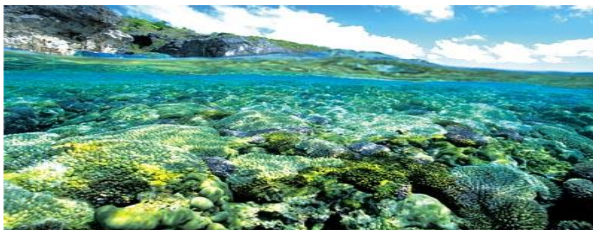
The beautiful coral of Niue

The only travellers allowed in to and out of Niue were returning residents, essential workers and families, and Niueans from abroad.