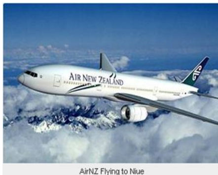
AirNZ Flying to Niue